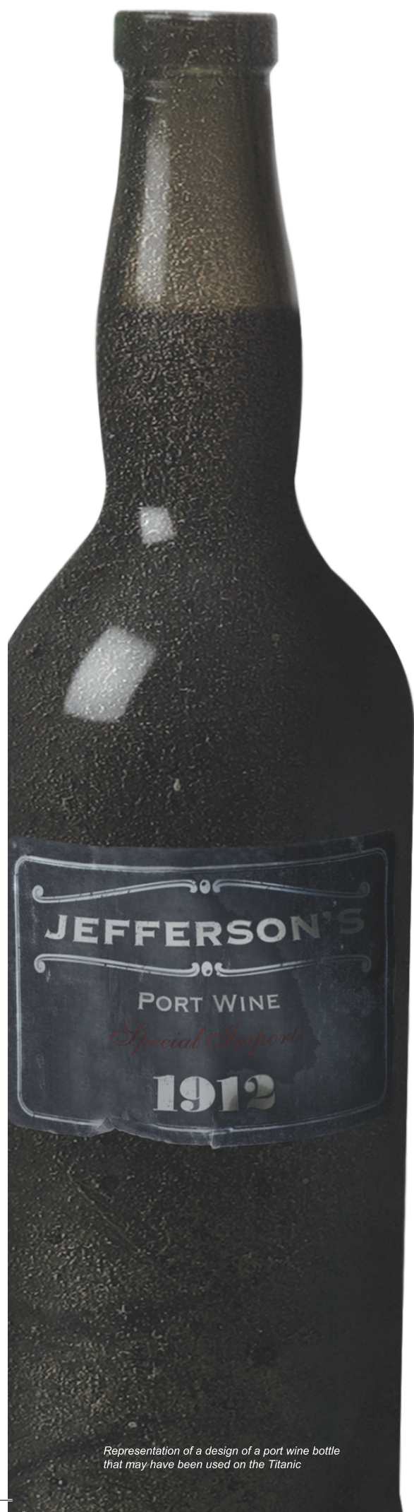
Representation of a design of a port wine bottle that may have been used on the Titanic

Discover more of Cumbria's history at your local library