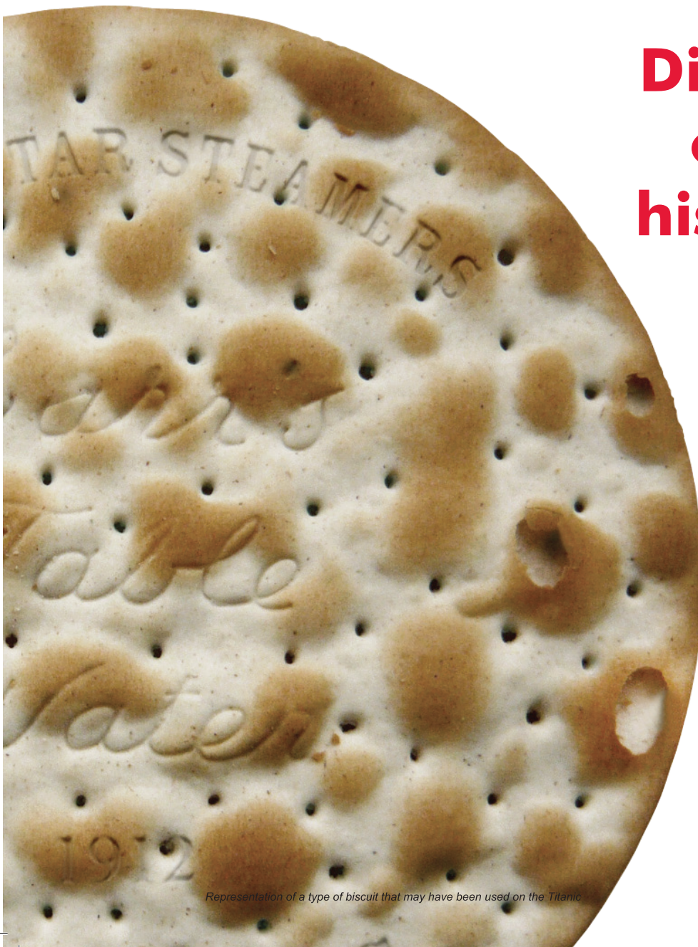
Representation of a type of biscuit that may have been used on the Titanic

Discover more of Cumbria's history at your local library