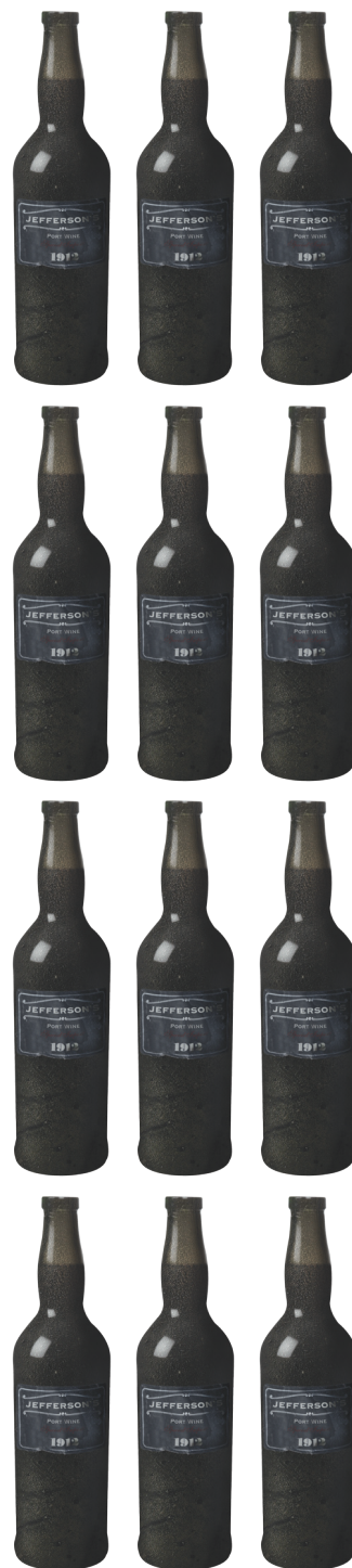
Representation of a design of a port wine bottle that may have been used on the Titanic